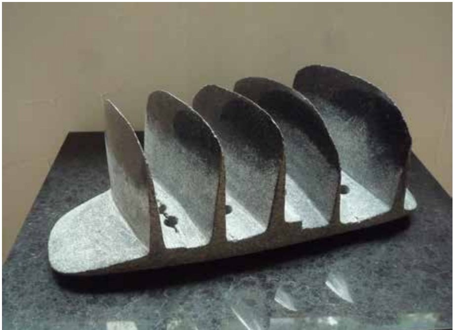
Small fruit C | 2017 | H 11 x W 34 x D 15 cm | 4.5kg African granite