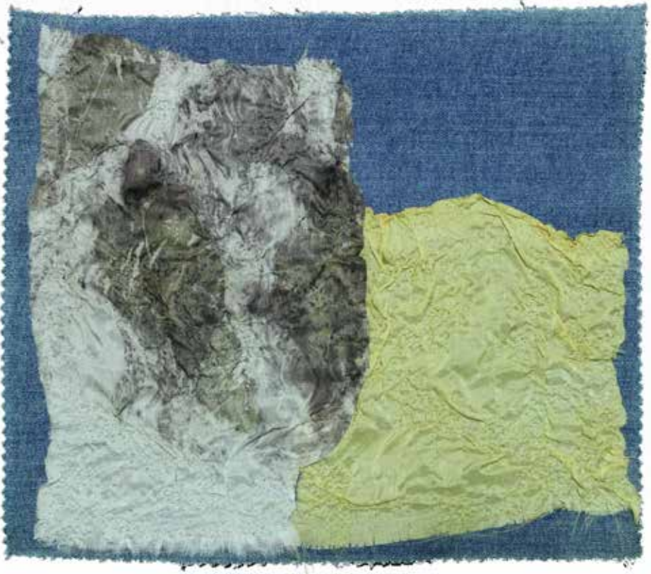
Cloud Carpet (pattern I) Size: 25 x 23 cms | Medium: Mixed media | Year of execution: 2017

"This is a note to myself, a recollection of the innumerable airplane journeys I have made at the window seat. The abstract landscapes of the clouds, the sky, the sun... that enable us to create patterns in our mind" - Nidhi Khurana