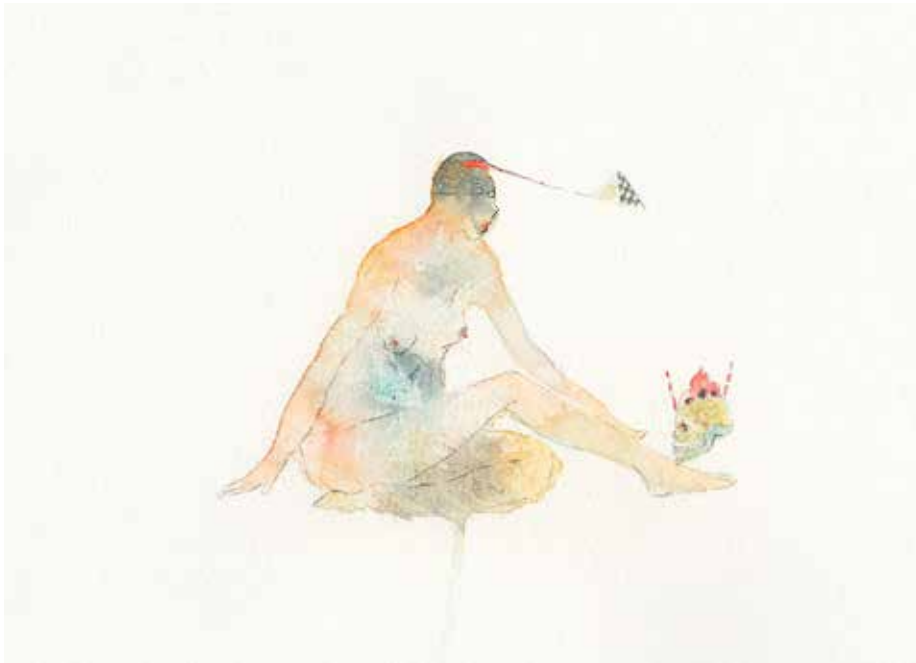
The Idling Juggler | 29.7 x 43 cm | 2015 Watercolour on paper

'All that we see or seem Is but a dream within a dream' — Edgar Allan Poe