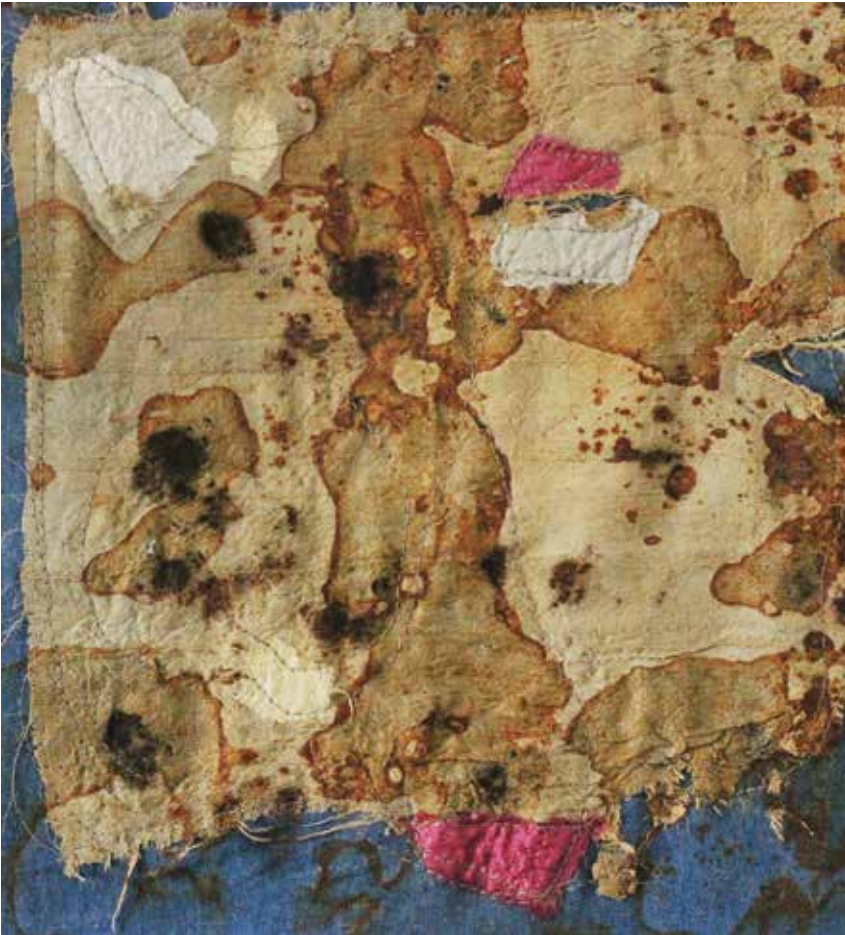
Terra incognita | Size: 25 x 23 cms | Year of execution:2017 Medium: Mixed media

Rebecca Solnit, A Field Guide to Getting Lost