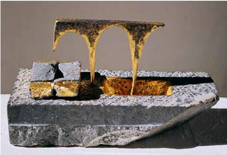
Shrine | 2007 | 22 x 8 x 13 cm or 8.5 x 3 x 5 inches kashmir limestone and gold gilded iron