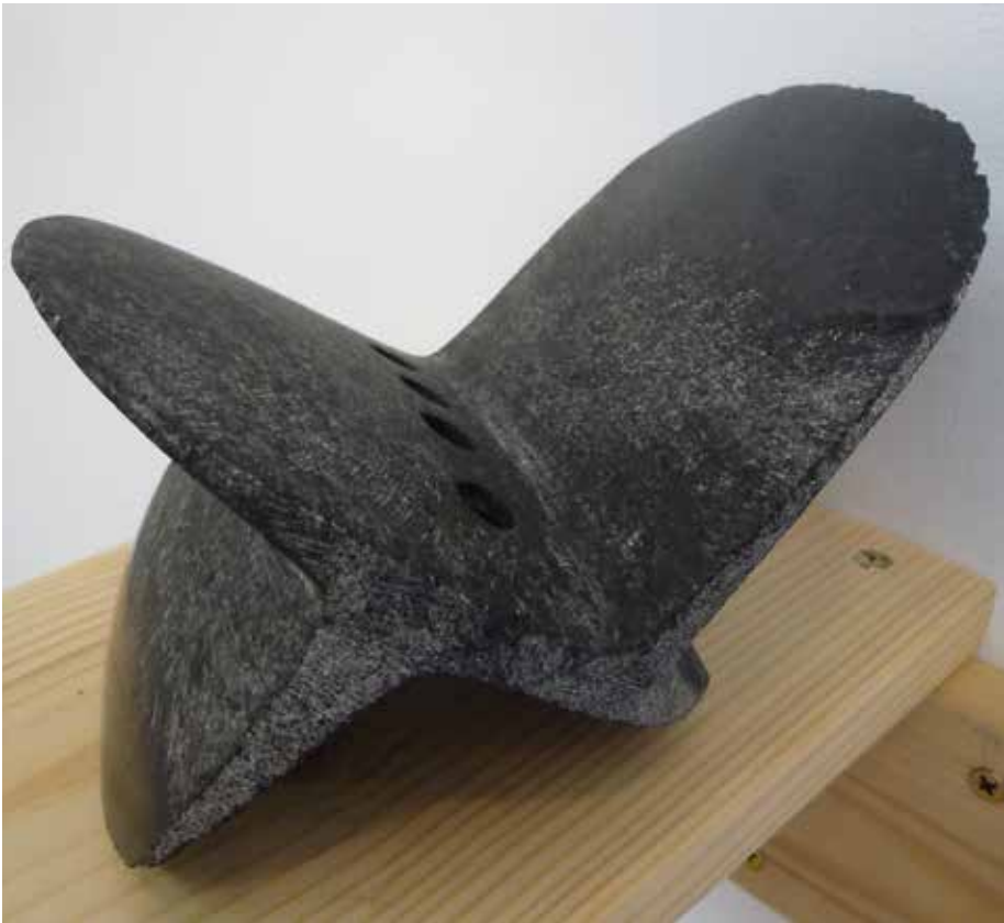
Small fruit G | 2017 | H 10.5 x W 15 x D 12.5 cm | 1.5 kg African granite