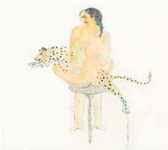
Gazing Each Other | 2013 | 36 x 38 cm Watercolour on paper

We will be living for the love we have.. Living not for reality — The Cranberries