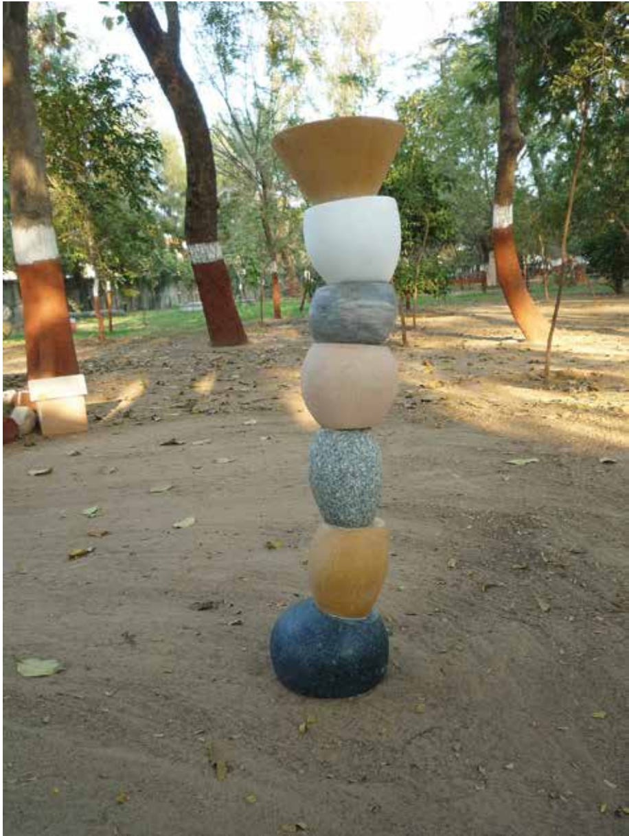
Coconut tower | 2018 | H 67 x W 15 x D 16 cm Granite, Sandstone, Marble