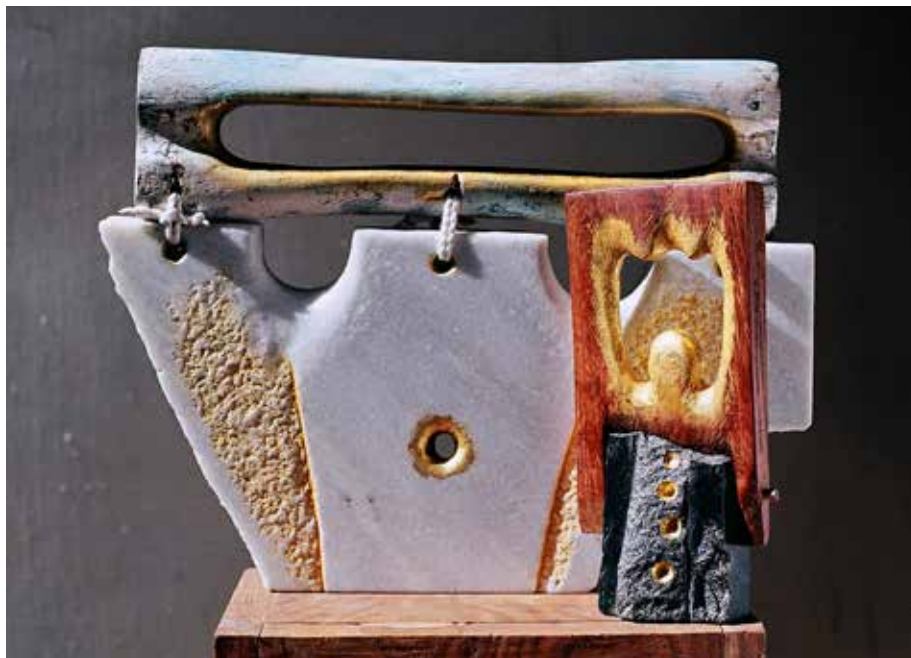
Black Bag, White Bag | 2008 | 38 x 15 x 29 cms. or 15 x 16 x 11.5 inches white marble, black granite and gold gilded wood