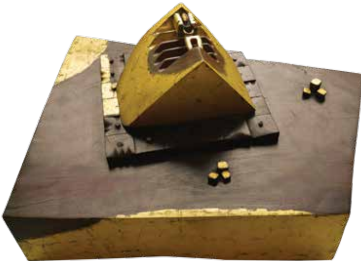
The blue bridge | 2002 | 51 x 38 x 25 cm or 20 x 15 x 10 inches gold gilded wood