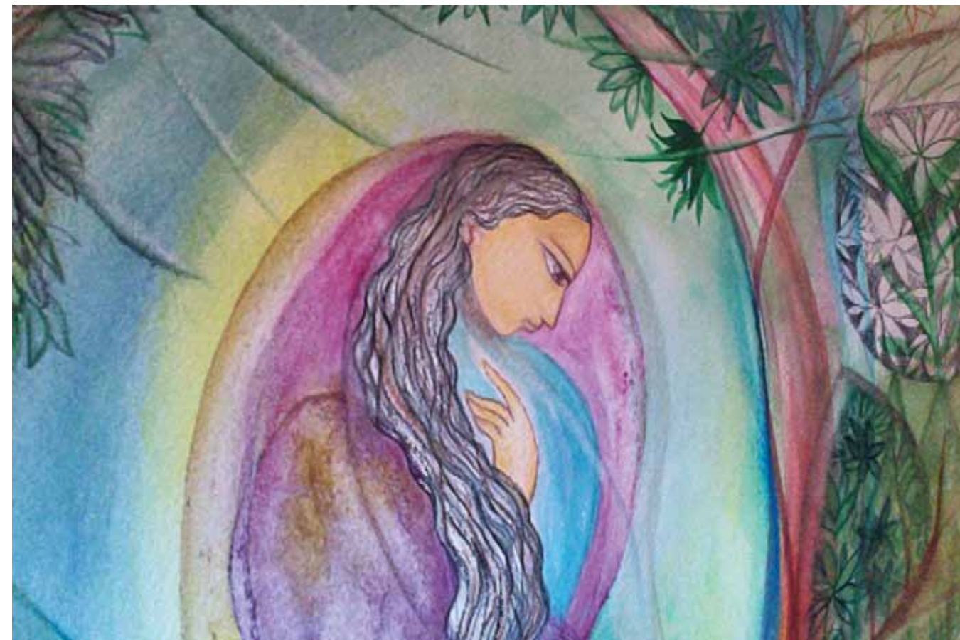
SITA IN ASOKVATIKA '13 | Watercolour and Gouache | 30 x 24 inches

Her books for children are “Fabled Book of Gods and Demons” (Puffin) and The Children’s Ramayana (Puffin). She conducts ‘Storypainting’ workshops for special needs children and is a founder –member of Sannidhi – an NGO that works in village schools.