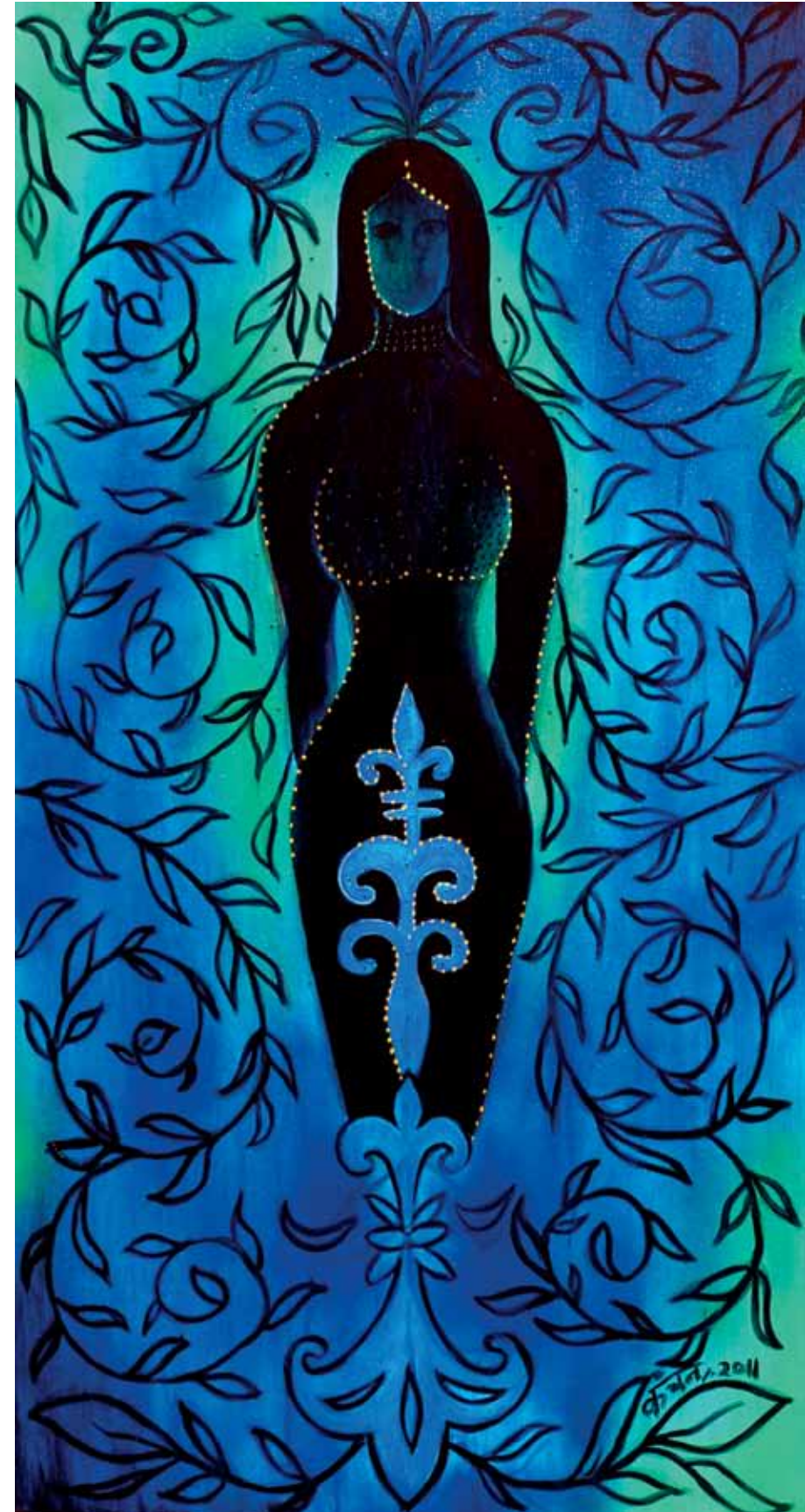
DEVI '11 | Acrylic & Swarovskis on Canvas | 27 x 52 inches