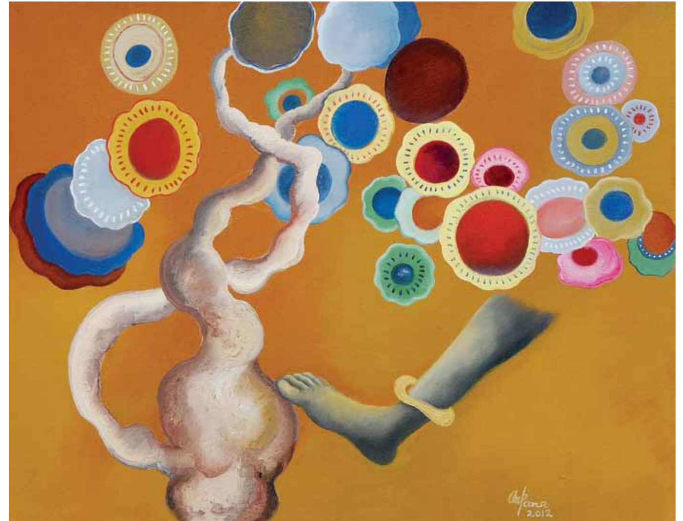
HER TOUCH '12 | Oil on Canvas | 31 x 40 inches

Born 1954. Exhibited since 1974 across the globe. Solos in Delhi, Mumbai, Calcutta, Bangalore, Chennai, London, Glasgow, Berlin, Amsterdam, Singapore, Munich, New York and in Stockholm and Copenhagen National Museum. Her work can be seen in Museums of Modern Art, in Delhi, Mumbai, Chandigarh, Dusseldorf, Singapore, Bradford, Stockholm, Hiroshima, Peabody Essex Boston, MOCA L.A, Brooklyn, Bharat Bhawan, Bhopal & Victoria and Albert Museum, London. Awarded a gold medal in the VIth International Triennale 1986 in Delhi. Was commissioned by Hiroshima Museum of Modern Art for work for its permanent collection for its 50th anniversary 1995, and by Bangalore and Hamburg to do large non-commercial murals in public spaces. Since 1981 she did three large non-commercial murals in Delhi and one in Kathmandu. She has a concern for environment, time, spirituality, condition of women and growing violence in the world, rooted in the language of ancient Indian Sculptures and Miniatures.