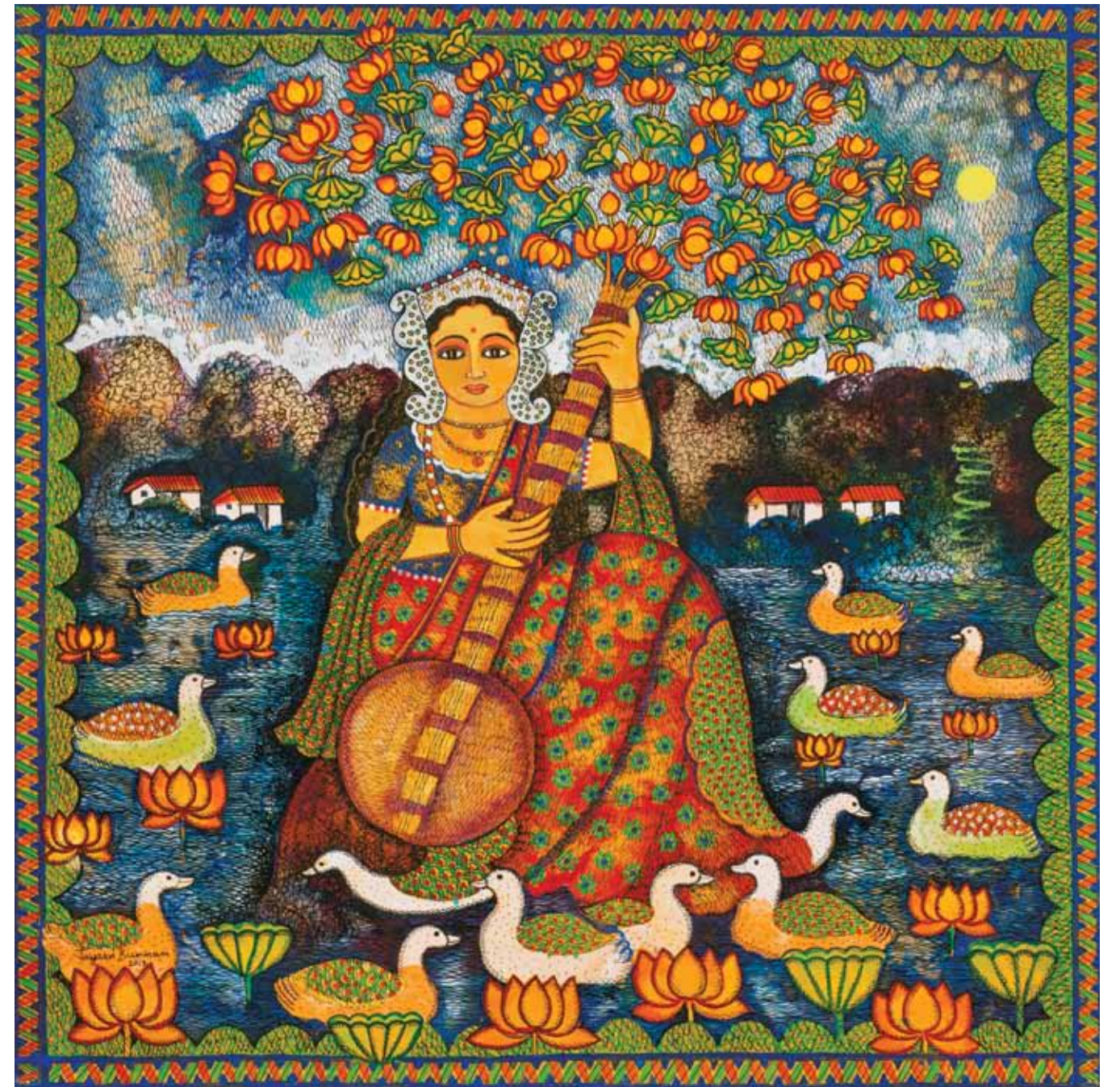
'KAMALA (SARASWATI)' '13 | Water Colour Pen & Ink on Paper | 24 x 24 inches