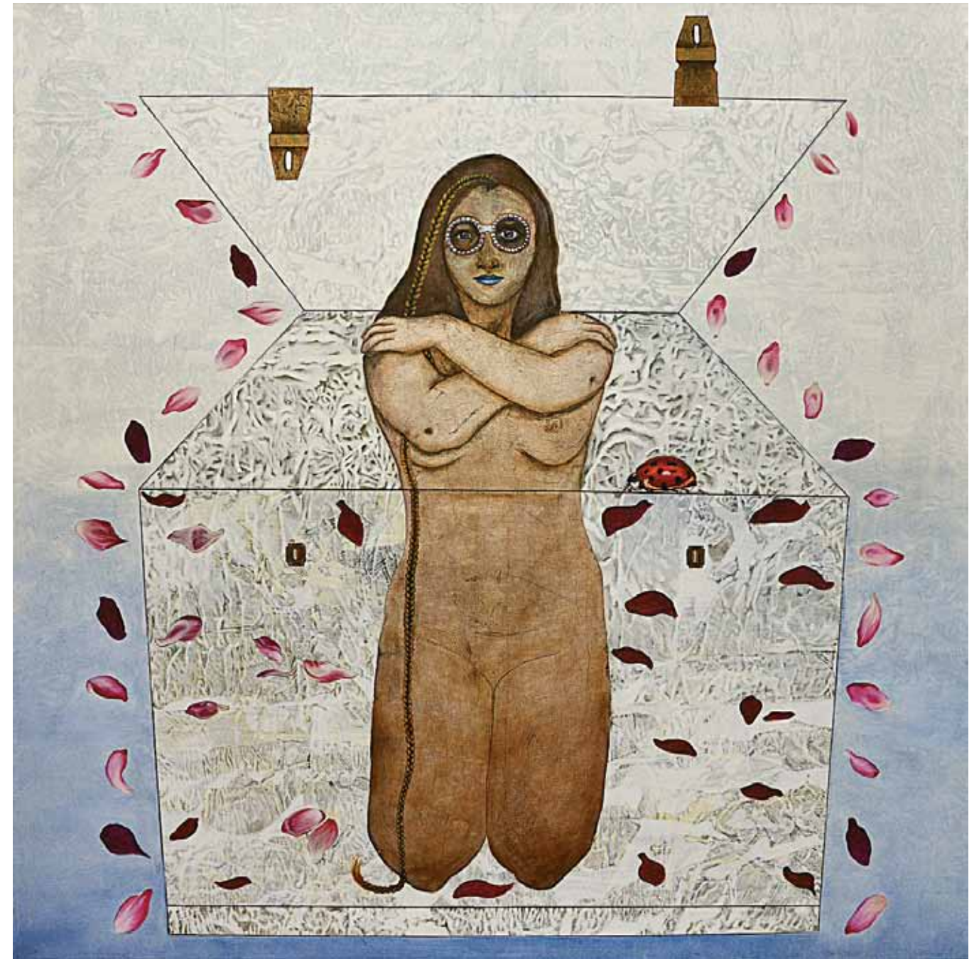
AND SHE WILL RISE '13 | Oil on Canvas | 48 x 48 inches