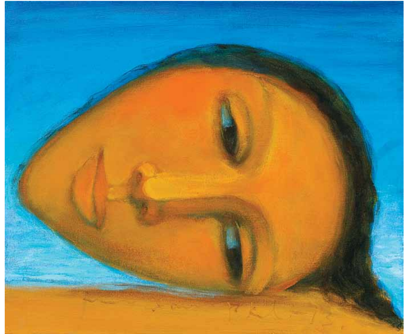
DEVI '13 | Acrylic on Canvas Board | 20 x 24 inches

Gogi Saroj Pal works and lives in Delhi.